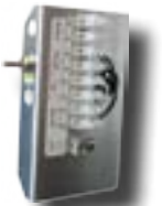
HOA Switch Terminal Board